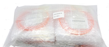
2 Bubble Bag