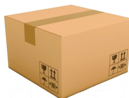
3, Paper Carton