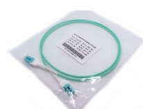
1, Self-seal PE Bag

This easily taken and well-protected fiber patch cable package has been labelled and marked by OMC as de-fault .Standard carton size : 34*22*15 cm; 44*34*24 cm ; 54*39*34 cm . Which carton to be used depends on goods Qty . Packing can be customized.