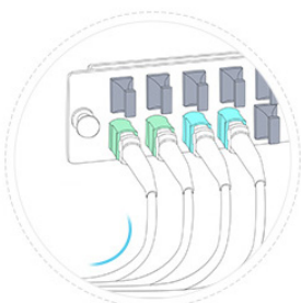
2 Pieces design

Double reinforced design with security plate better protects the cables by making the bend radius of the cables smaller when they are connected with the adapters.