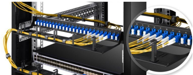
Cable management bracket