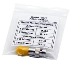
1, Single PE Bag

This easily taken and well-protected fiber optical cable package has been labelled and marked by OMC as default. Standard carton size : 34*22*15 cm ; 44*34*24 cm ; 54*39*34 cm . Which carton to be used depends on goods Qty . Packing can be customized.