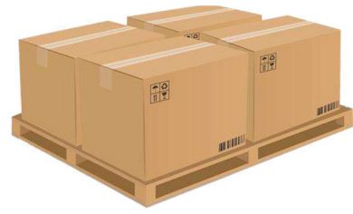
3, fumig-free Pallet