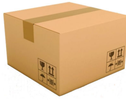
2, Paper Carton