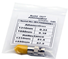
1, Single PE Bag

This easily taken and well-protected fiber optical cable package has been labelled and marked by OMC as default. Standard carton size : 34*22*15 cm; 44*34*24 cm ; 54*39*34 cm . Which carton to be used depends on goods Qty . Packing can be customized.