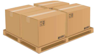
3, fumig-free Pallet