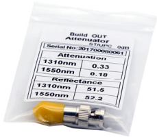
1, Single PE Bag

This easily taken and well-protected fiber optical cable package has been labelled and marked by OMC as default .Standard carton size : 34*22*15 cm; 44*34*24 cm ; 54*39*34 cm . Which carton to be used depends on goods Qty . Packing can be customized.