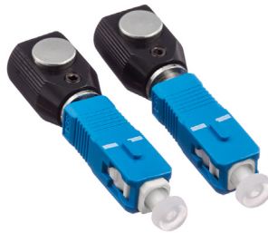
Oval body 2