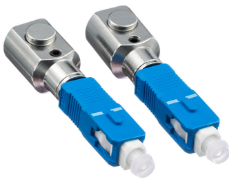
Oval body 1