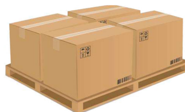
3, fumig-free Pallet