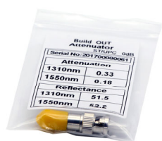
1, Single PE Bag

This easily taken and well-protected fiber optical cable package has been labelled and marked by OMC as default .Standard carton size : 34*22*15 cm; 44*34*24 cm ; 54*39*34 cm . Which carton to be used depends on goods Qty . Packing can be customized.