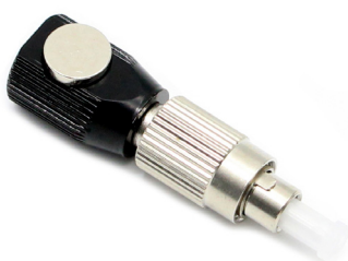
Oval body 2