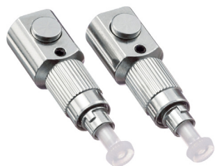
Oval body 1